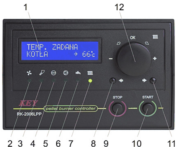
Figure 1. Front panel of RK-2006LPP controller.